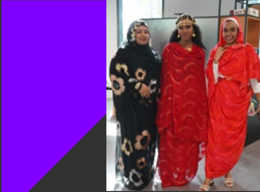
Celebrating the rich tapestry of cultures at 42 Abu Dhabi Coding School!

42 Abu Dhabi's Cultural Day was a vibrant showcase of the global spirit, with students from over 51 nationalities coming together in a harmonious celebration. Traditional attires added a burst of color to the event. The event highlighted the beauty of unity in diversity, reaffirming our commitment to fostering a truly inclusive community.