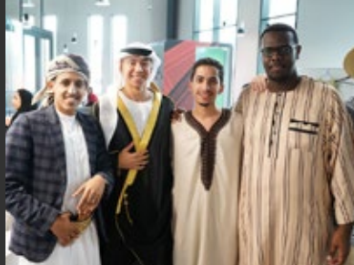
Embracing the diversity that fuels creativity and innovation.