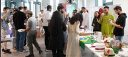
Our Cultural Day unites students in a vibrant showcase of traditions, food.